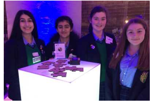
4 year 9 students pitched their 'Lunar Jigsters' at the 2019 Design Ventura challenge.