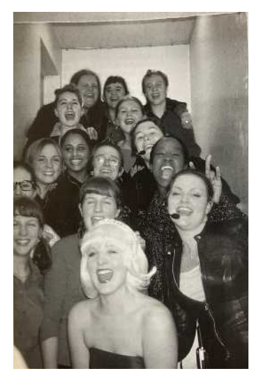
The 2001 cast of Grease the musical!