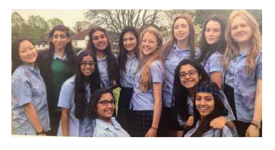
The obligatory shirt signing tradition on the last day of term for the class of 2017!