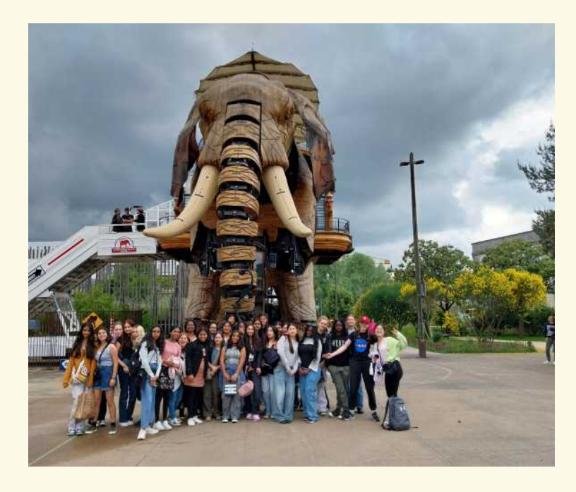
Students boarded Nantes 12m high mechanical elephant