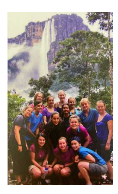
Class of 2012 World Challenge Trip.