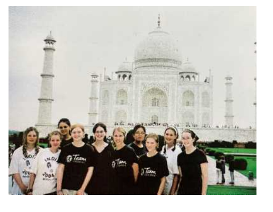
Class of 2005 World Challenge trip to the Taj Mahal.

In 1990, the whole school threw a Christmas party with a retro-chic 1960s theme. Students showed up in bold, funky outfits—pieces clearly cherished by their parents, who still remembered the heyday of Beatlemania!