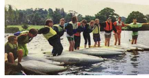
Year 8 July 1994 Watersports holiday to the south of France and Spain enjoying kayaking, snorkelling and sailing toppa boats.